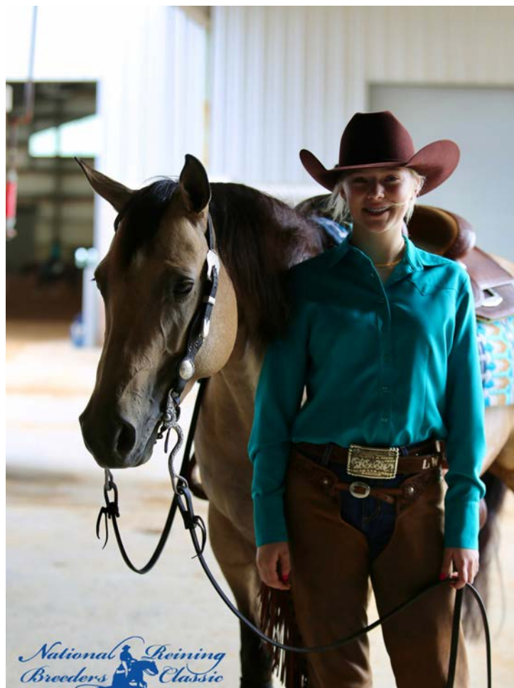
National Reining Breeders Classic

She thanked everyone at the Tremblay barn, along with her mom, her dad, her sister, and her horse.