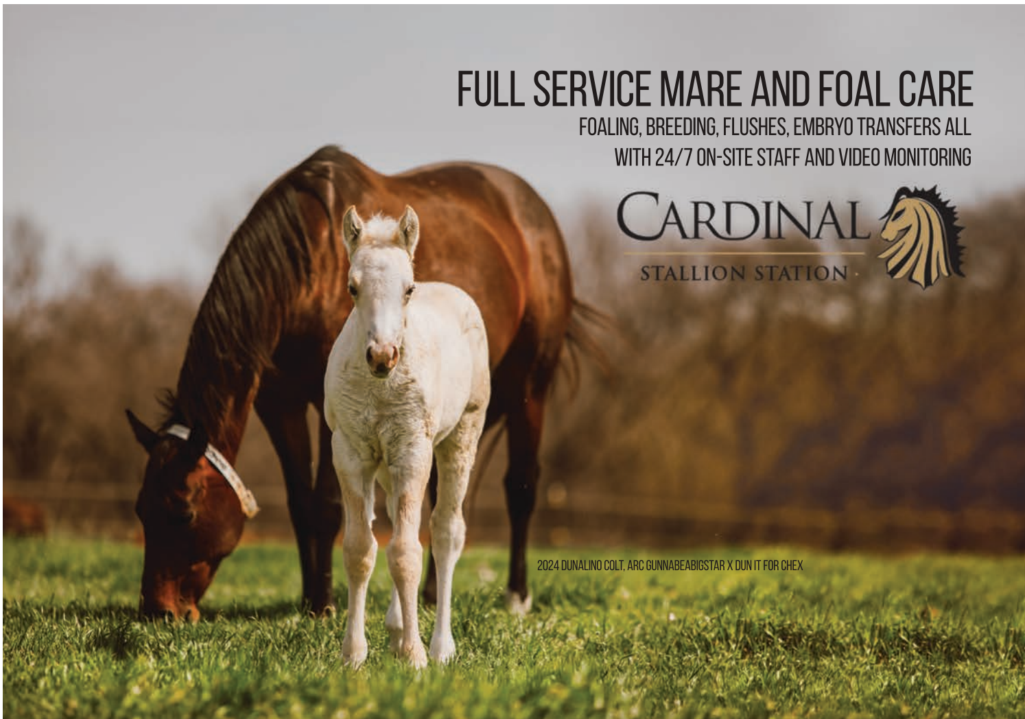
2024 DUNALINO COLT, ARC GUNNABEABIGSTAR X DUN IT FOR CHEX

DEDICATED TO THE GLOBAL PURSUIT OF REINING PERFECTION