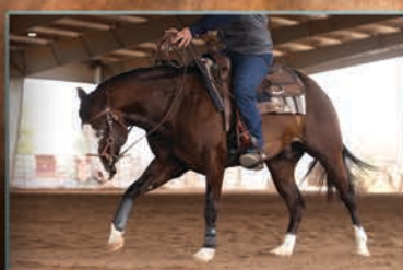
SPOOKS GRAND SLAM FIRST FOAL CROP: 2YO's