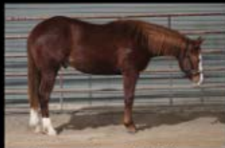
Plutos Special Nite