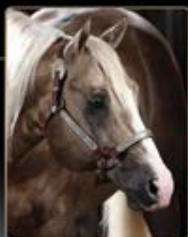
WIMPYS LITTLE STEP