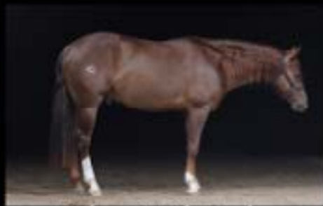
Riding With Red

Gunners Special Nite X Sheza Zipn Starlet