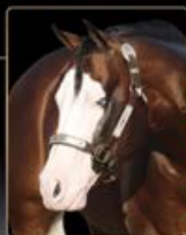
SPOOKS GOTTA GUN