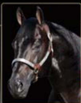
A SPARKLING VINTAGE