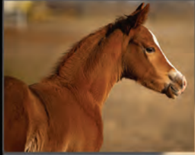
Photo taken at age 32