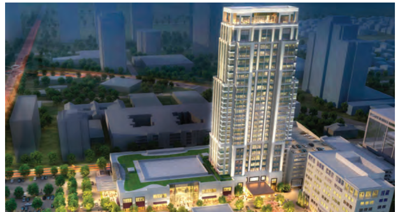
THE POST OAK