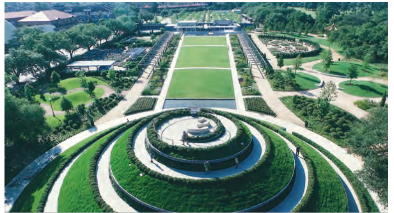
HERMANN PARK CONSERVANCY CENTENNIAL GARDENS