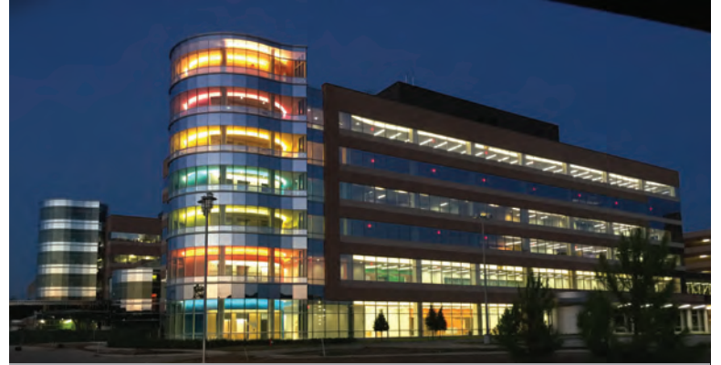
TEXAS CHILDREN'S HOSPITAL THE WOODLANDS CAMPUS