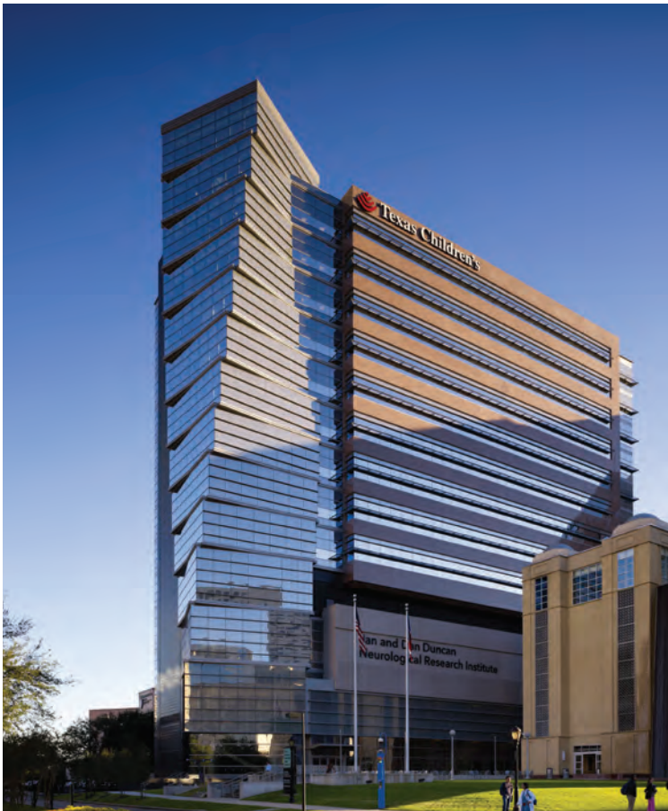
TEXAS CHILDREN'S HOSPITAL JAN AND DAN DUNCAN NEUROLOGICAL RESEARCH INSTITUTE