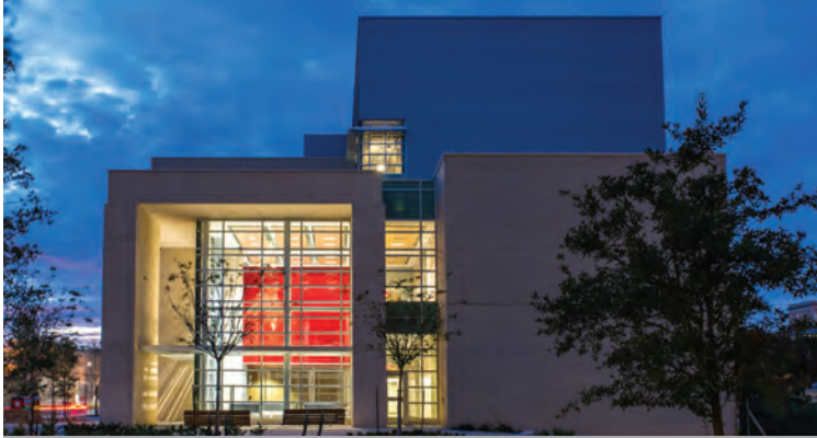
UNIVERSITY OF HOUSTON MULTIDISCIPLINARY RESEARCH AND ENGINEERING BUILDING