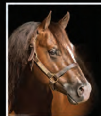
2008 AQHA STALLION NU CHEX TO CASH X BS LILLY STARLIGHT MILLION DOLLAR SIRE NRHA OPEN FUTURITY CHAMPION LIFE TIME EARNINGS $279,000+ OWNED BY LIL JOE CASH, INC.