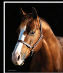
2011 AQHA STALLION WIMPYS LITTLE STEP X CHICS FANCY LADY NRHA OPEN LEVEL 2 & 3 FUTURITY CHAMPION, 3RD LV 1 LIFE TIME EARNINGS $179,700+ OWNED BY ALPHA QUARTER HORSES, LLC