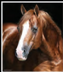
2008 AQHA STALLION TOPSAIL WHIZ X SHEZA SHADY SLIDER HIGHEST SCORING HORSE EVER RECORDED IN EUROPEAN HISTORY, 236 LIFE TIME EARNINGS 176,700 OWNED BY STORBOOK STABLES