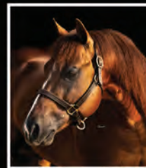
2016 AQHA STALLION GUNNATRASHYA X HA CHIC A TUNE NRHA OPEN LEVEL 4, 3 AND 2 FUTURITY CHAMPION LIFE TIME EARNINGS 285,000+ OWNED BY STORBOOK STABLES