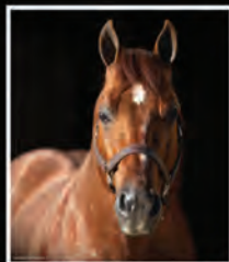
2005 AQHA STALLION JACKS ELECTRIC SPARK X HOT COBOLD CANDY MILLION DOLLAR SIRE NRHA L3 OPEN FUTURITY CHAMPION LIFE TIME EARNINGS $215,000+ OWNED BY JARED AND EARLE LACLAIR