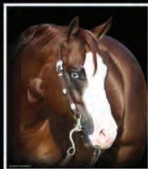
2004 AQHA STALLION GUNNER X WIPYS DOOL $5 MILLION DOLLAR SIRE NRHA OPEN FUTURITY RES LEVEL 4 CHAMPION LIFE TIME EARNINGS $235,000+ OWNED BY TURNABOUT FARM, INC.