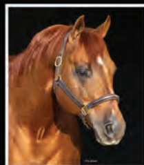
2009 AQHA STALLION GUNNER X MISS TINSULTOWN NRHA OPEN LEVEL 4 RES FUTURITY CHAMPION LIFE TIME EARNINGS $307,000+ OWNED BY SILVA REINING HORSES