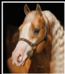
2003 AQHA STALLION SMART SHINER X TRONAS PEARL MILLION DOLLAR SIRE LIFE TIME EARNINGS $110,400+ OWNED BY LIL LORETT