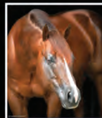
2011 AQHA STALLION MAGNUM CHIC DREAM X MYO STARLIGHT MULTIPLE MAJOR EVENT FINALIST LIFE TIME EARNINGS $115,000+ OWNED BY KATY BIESECKER