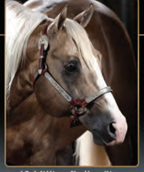
12 Million Dollar Sire