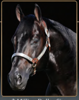
2 Million Dollar Sire